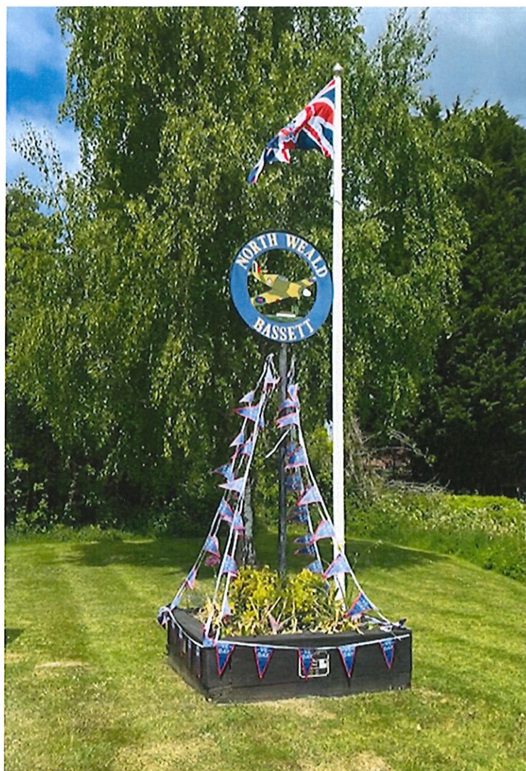
Flagpole, Village Green, North Weald Bassett