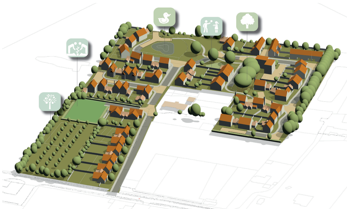
3D CGI showing the proposed layout

Existing access off High Road will be retained and improved