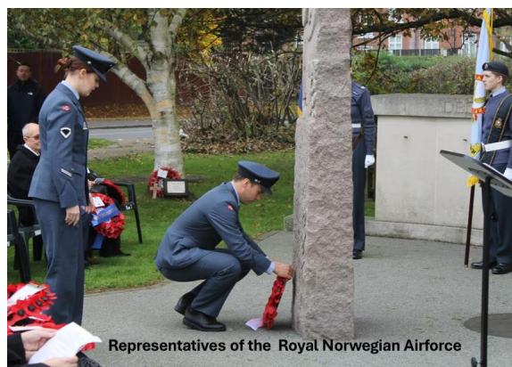
Representatives of the Royal Norwegian Airforce