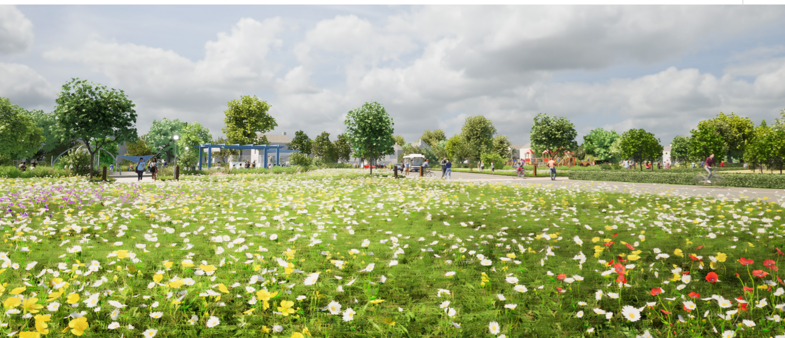
View along internal Pedestrian Cycle Path

New homes will include those suitable for first time buyers, families, disabled and the elderly. 40% of homes would be provided as affordable housing, including first homes, social rented housing and shared ownership homes, that would be available to local people.